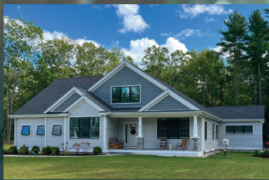
Similar Homes with some upgrades shown.